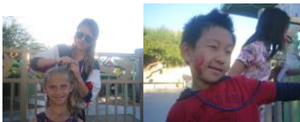
Pictures from our Olympic Fall Festival that the intermediate children put on for all CARE kids.